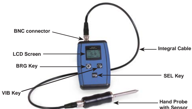
Figure 1. The VBA20